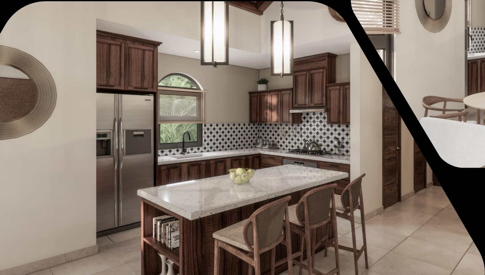
Paso Fino Interior Examples