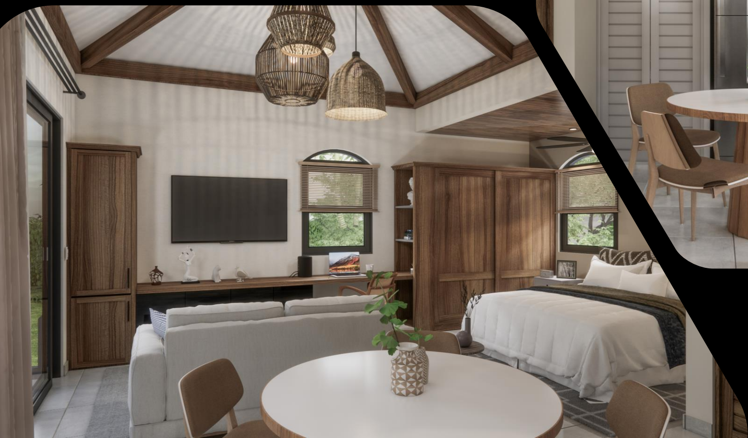
Galician Interior Examples